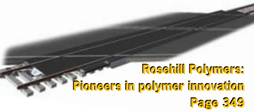
Rosehill Polymers: Pioneers in polymer innovation Page 349