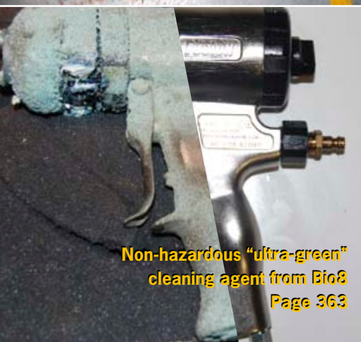
Non-hazardous "ultra-green" cleaning agent from Bio8 Page 363