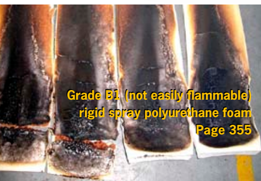
Grade B1 (not easily flammable) rigid spray polyurethane foam Page 355