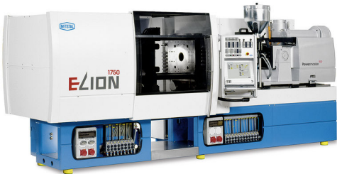
Elion 1750 injection moulding machine from Netstal-Maschinen AG

Last year, at its Küssnacht plant in Switzerland, Gerresheimer Medical Plastic Systems also started gradually replacing its lines for the production of cuvettes with new high-performance equipment – including fully electric Elion injection moulding machines from Netstal-Maschinen AG , Näfels, Switzerland. Gerresheimer manufactures these cuvettes on behalf of a leading diagnostics group.