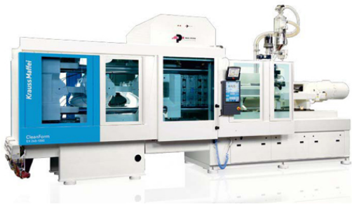
KraussMaffei EX injection moulding machine

Whether these are single-use products such as syringes and pipette tips or functional components such as inhalers, the demand is always for hygienically impeccable products with 100% quality. For this, the manufacturers of injection moulding machines get together with cleanroom specialists to offer a variety of cleanroom solutions tailored to the article being produced and factory conditions. A simple and inexpensive approach is the mounting of a laminar-flow unit over the clamping plates for the injection mould. This excludes any exchange with unclean outside air. The injection moulding machine itself stays in the gray room and the injection mouldings are fed for further processing via an airlock into the cleanroom proper. Even if a cleanroom tent is placed over parts of the injection moulder, the latter can still be operated from outside the cleanroom. The most elaborate solution involves the operation of the injection moulding machine in the cleanroom itself. Along with operating staff wearing special clothing, the machines and moulds themselves are also potential sources of particulate contaminants. The all-electric injection moulding machines now rapidly gaining ground can fully exploit their advantages here. Compared to conventional hydraulic machines, they generate barely any waste heat and, as a result of their encapsulated drive units, are free of lubricants and other abraded particles that might contaminate the injection mouldings.