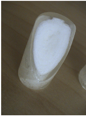
Fig. 4: Cork stopper

SmartFoam structures are like the skin of humans; outside a very thin and resistant skin and underneath the soft structure. Therefore the process is especially suitable for the production of parts like TPE pacifiers for babies for example. Nature was used as archetype for the SmartFoam process also in the processing of hard resin types like glass-filled polyamide, where the structure of those products are bone-like with highest bending stiffness.