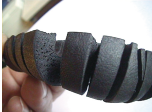
Fig. 1: Gear shift knob

Main uses for the nice material group of TPEs are soft protection, sealings, and parts with hand or skin contact. Warm feeling and soft-touch are properties that people associate with soft plastic. If you look around, you will see that TPEs make your life more comfortable; for example with tooth brushes, where often more than one component is TPE, car interiors, or machines for household and tools. The handles of nearly all hand drilling machines are covered with soft-touch TPE to get a good grip. Also most pens are supplied with a ring of TPE for easy handling and warm feeling at your finger.