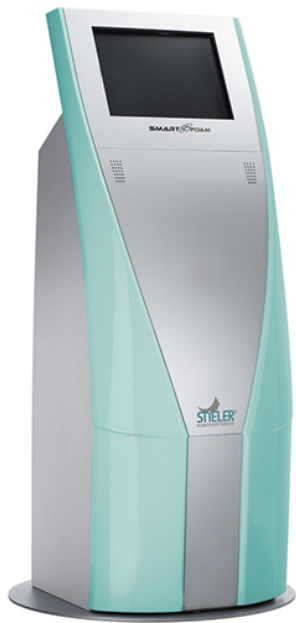
Fig. 2: SmartFoam controller

Melt is injected into a mould on a one-component injection moulding machine for a definitive amount. During injection phase the SmartFoam fluid like nitrogen, water or liquid CO 2 is added to the feed and mixed just before the gate. After the first amount of melt has build-up a skin at the cold mould surface, the mixture of melt and fluid in entering the cavity with easy flow and expands quickly. The first amount of melt will sort out the compact surface image without contact to any foaming agent. The melt-fluid mixture is expanding and filling the mould core quickly and without any back pressure. No flash in the trimming line is expected, no high clamp force is needed. The amount of melt, the heat and cooling energy are almost 20–30 % less compared to the compact volume. The expansion of the foam bubbles inside the cavity cools the mixture from inside of the product and presses the skin outside into the cooling mould surface.