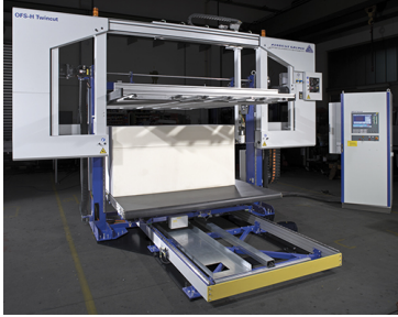
OFS-H Twincut horizontal contour cutting machine

Under this motto, Albrecht Bäumer GmbH & Co. KG, the long-established German manufacturer of cutting equipment, will showcase its latest products at K 2010.