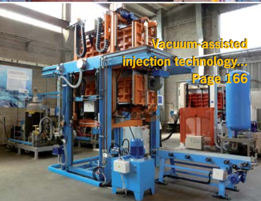
Vacuum-assisted injection technology... Page 166