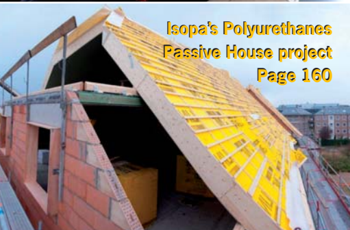
Isopa's Polyurethanes Passive House project Page 160