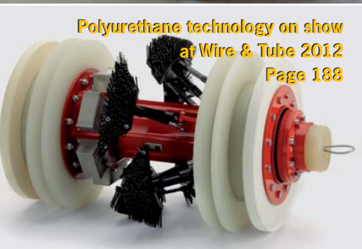
Polyurethane technology on show at Wire & Tube 2012 Page 188