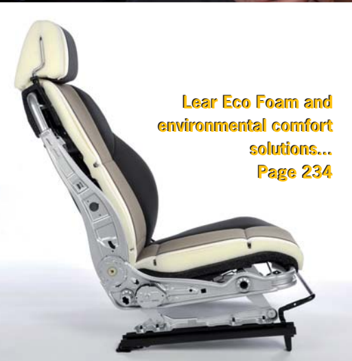
Lear Eco Foam and environmental comfort solutions... Page 234