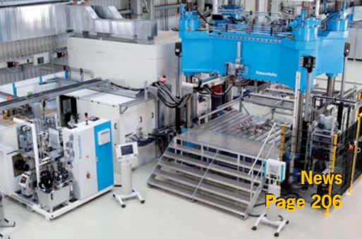
News Page 206