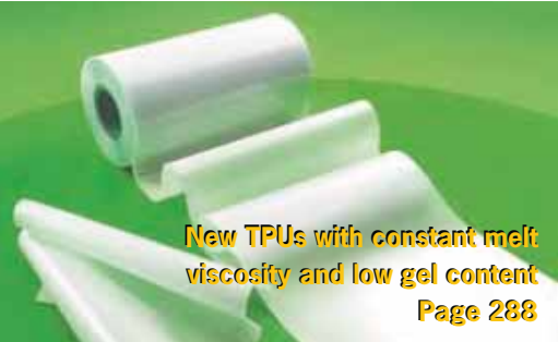
New TPUs with constant melt viscosity and low gel content Page 288