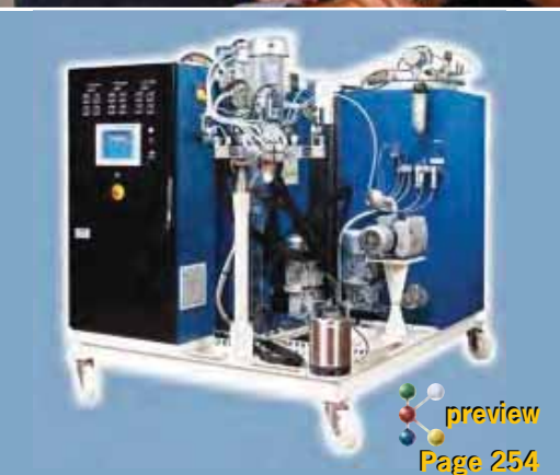
preview Page 254