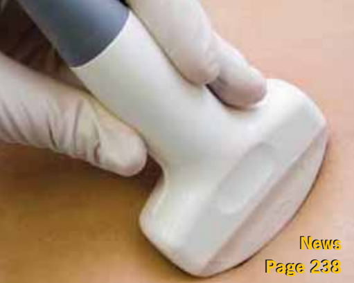
News Page 238