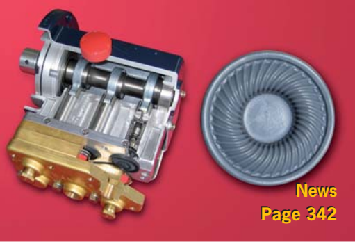
News Page 342