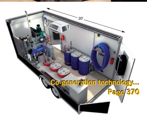
Co-generation technology... Page 370