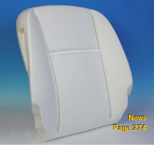
News Page 274