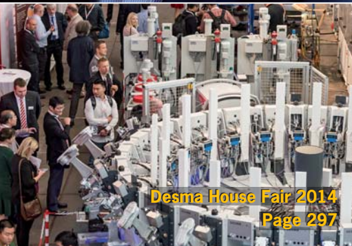
Desma House Fair 2014 Page 297